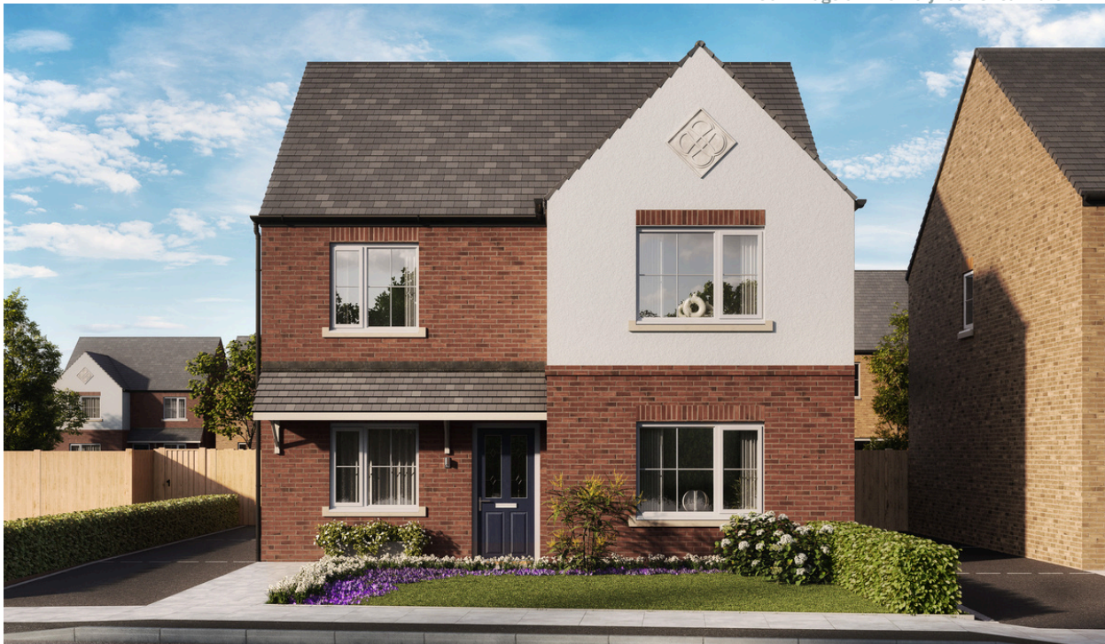
CGI Image of 'The Molyneux Shearwater'